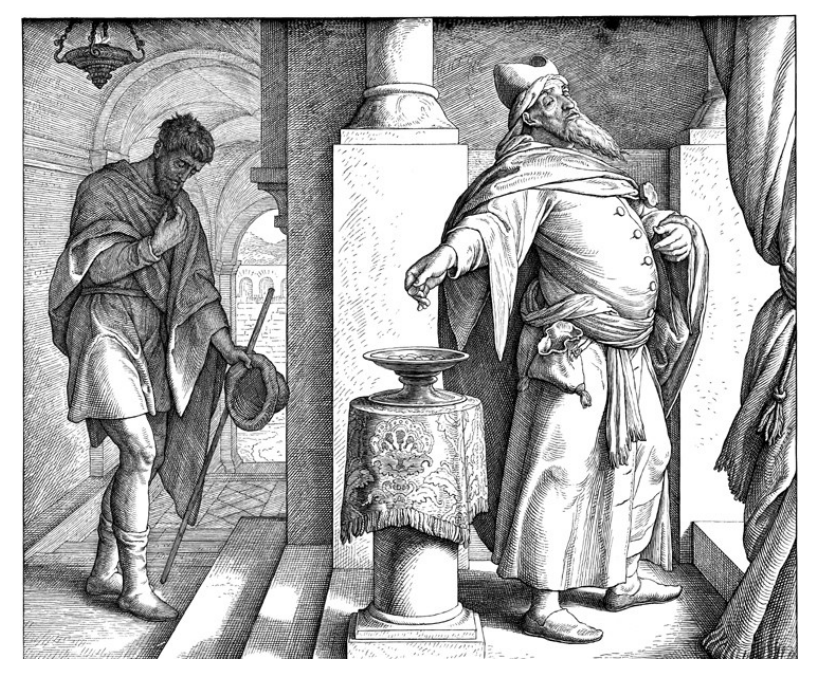
Eleventh Sunday after Trinity August 23, 2020