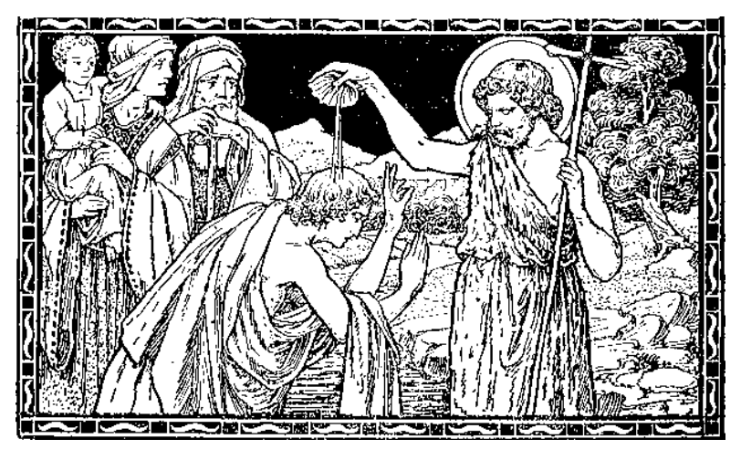
The Fourth Sunday in Advent Rorate Coeli – "Rain down, O heavens, from above!" December 20, 2020